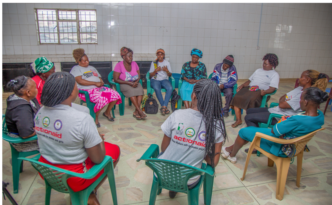
Focus group discussion with women on how to end violence against women and girls.

NUMBER of community members that ActionAid has reached and raised awareness on gender violence in Mukuru and Nyalenda informal settlements through community forums.