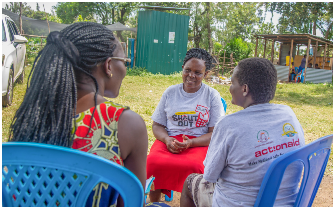
Discussion with women on how to end violence against women and girls in Nyalenda Kisumu County.

Therefore, inclusive, and transformative technology and digital education are crucial for a sustainable future. The digital age also comes with a lot of exclusion and disparity, especially for communities that lack essential services like electricity, connectivity, knowledge, and exposure to current innovations and poverty. Innovations in gadgets like smartphones, laptops, tablets, Wi-Fi connectivity in homes and schools may not be available for many communities deep in the rural and marginalized areas and, there-