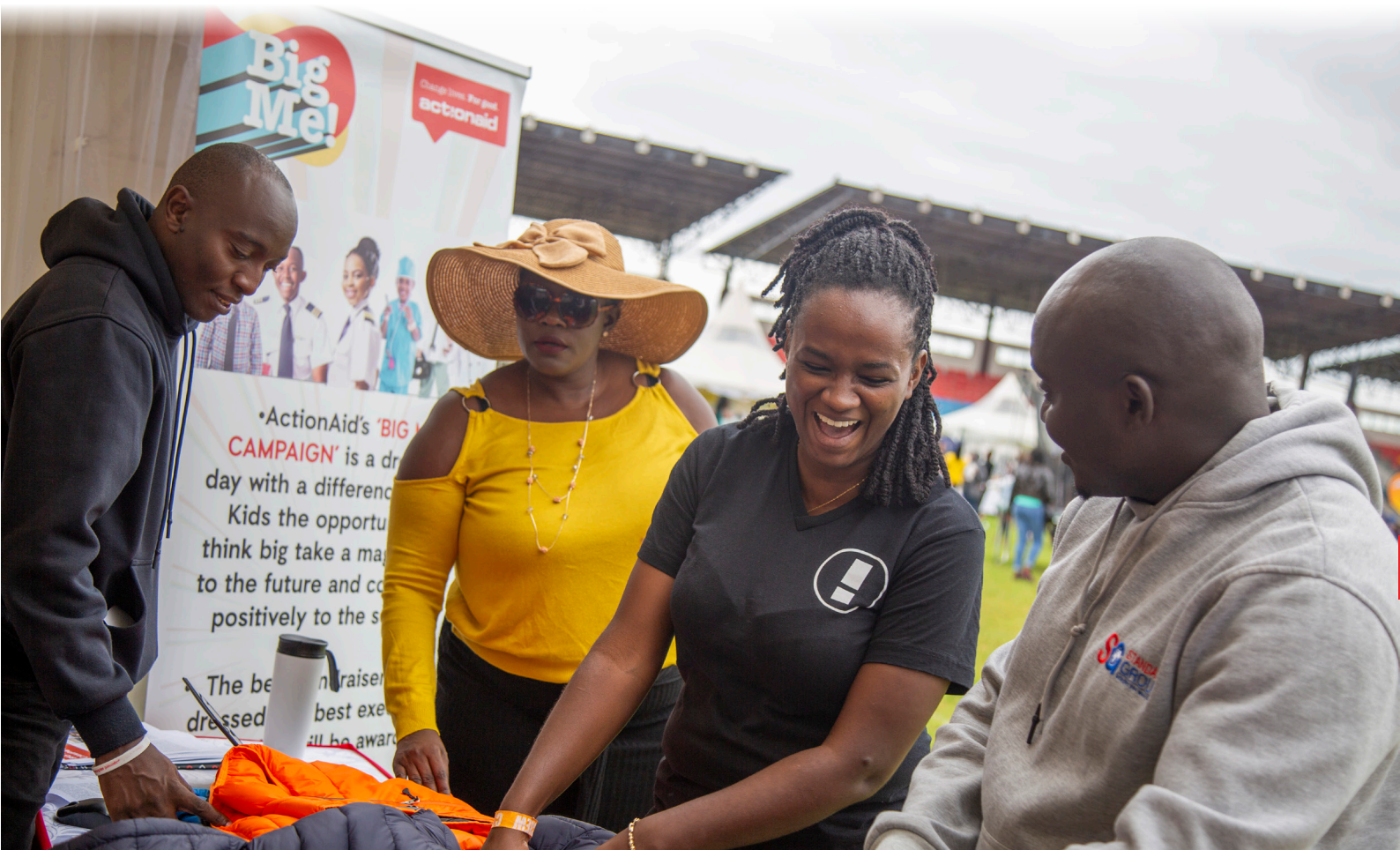
Participants sign up at the Big Me Campaign stand.

Overall, the event provided an excellent opportunity for the Big Me campaign to engage many children and parents and enhance the brand.