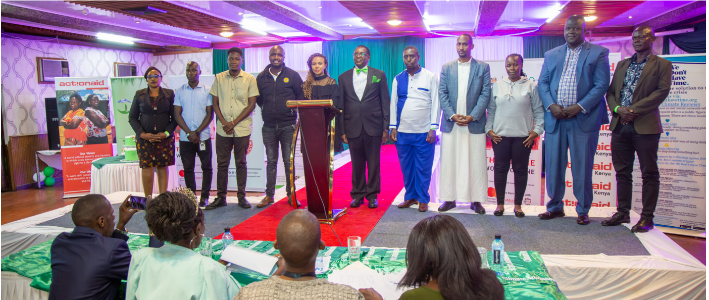
Dignitaries including AAK team take a photo during the Mr and Miss Climate Kenya event that was held at KICC.