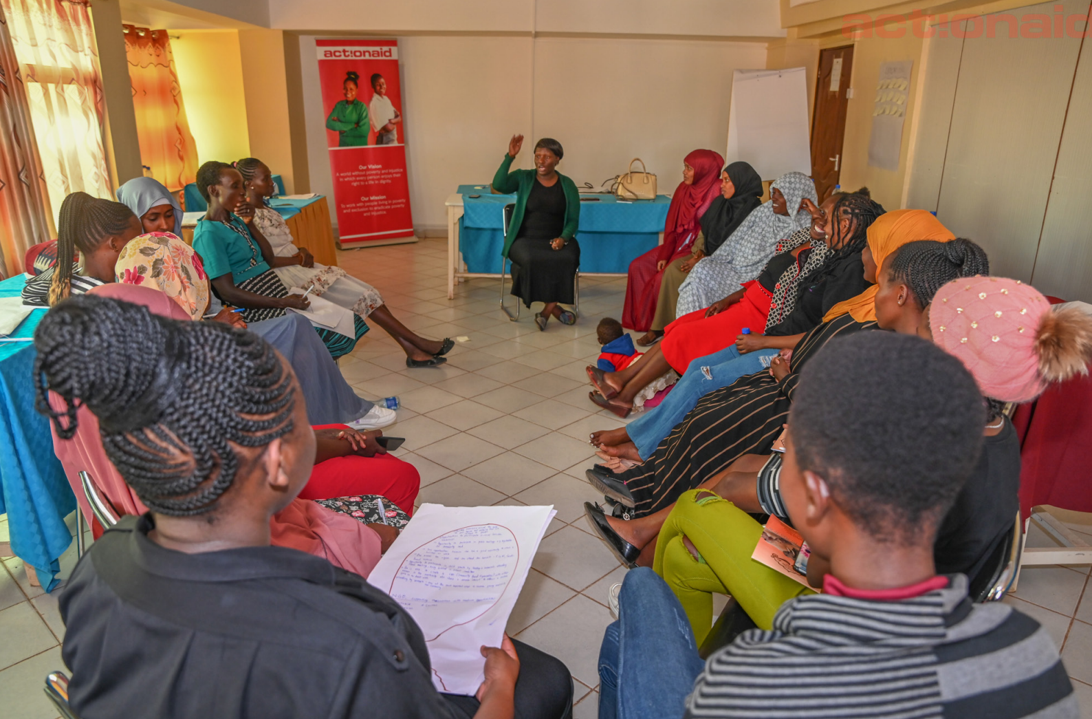
Safety and Dignity tool kit training in Isiolo County