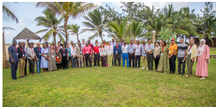
Heads of Finance Meeting at Ocean Beach Resort in Malindi.

chance to interact with Kilifi community members and partners through field visits. Kilifi County is a key partner and ActionAid Kenya has and is currently implementing programmes in the county. Key projects include the Local Rights Program in Magarini and the Education for Life Projected that targeted Out of School Girls.