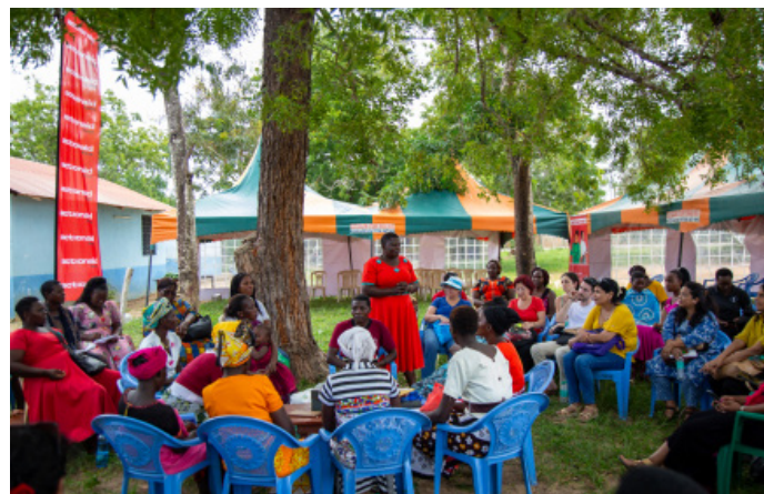
Women Directors Forum engagement with the community in Marafa, Kilifi County

The ActionAid at 50 event was attended by over 600 community members and 300 international guests.