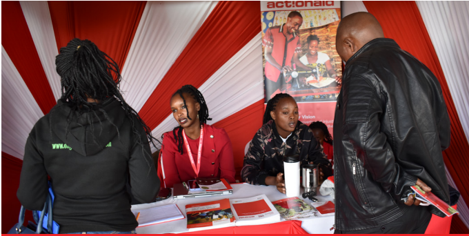
AAIK staff engaging with the public during the NGOs Week on Monday, June 5, 2023, at the KICC Comesa Grounds, Nairobi.

During the exhibition, we interacted with participants and exhibitors from different organisations, eager to know what ActionAid does and where we work. In line with this year's theme, most of those who visited AAIK's booth wanted to know how our organization works with communities affected by the drought since 2021, deemed the worst in 40 years.