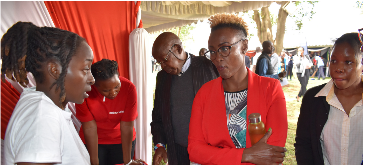
ActionAid Kenya's staff engaging with the public during the NGOs Week on Monday, June 5, 2023, at the KICC Comesa Grounds, Nairobi.

Following our interactions during the three days of exhibition at the NGO Week 2023, ActionAid International Kenya looks forward to meeting persons and organisations to chart new (or rekindle past) partnerships as we continue to work in solidarity with people living in poverty and exclusion, building their capacities to demand for their rights and nurturing sustainable and resilient livelihoods.