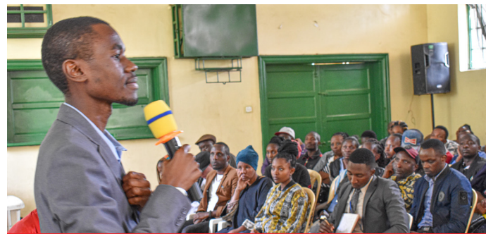
Members of the public air their views during the Finance bill discussions at Pumwani social hall

During the plenary, the participants- drawn from all wards in Nairobi- indicated that capacity building on various societal issues must be done on a rolling basis for Kenyans to participate from the point of knowledge. "It is hard to engage effectively during public participation when you do not understand the subject. I implore the public and private sectors and development organizations to continually build the communities' capacity to engage the various government departments in legislation processes ably.