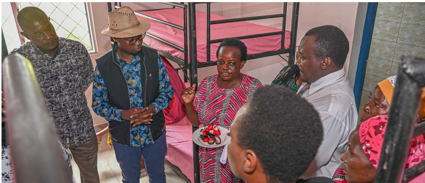
Dignitaries are being taken inside the protection center.

ActionAid has implemented a local rights programme in Mwakirunge and Bamburi for the last ten years, which has seen livelihoods change for the better. Through the Local Rights Programme approach, we fund projects and programmes in a locality to ensure that poor and marginalized populations secure sustained improvement