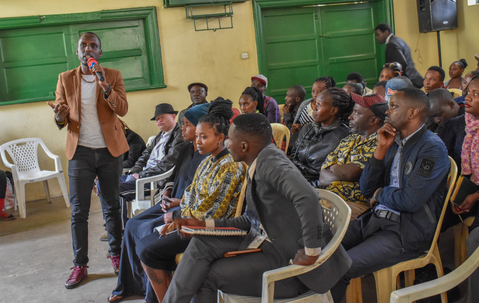
Participants at the Finance bill discussion forum at Pumwani social hall.