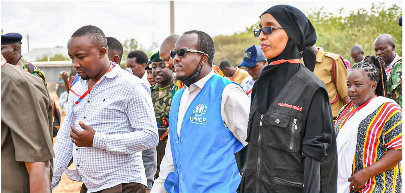
National Pre-Launch of Day of the African Child in Garissa County