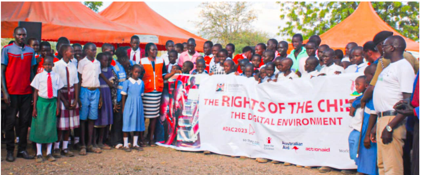
Day of the African Child event in Makueni County