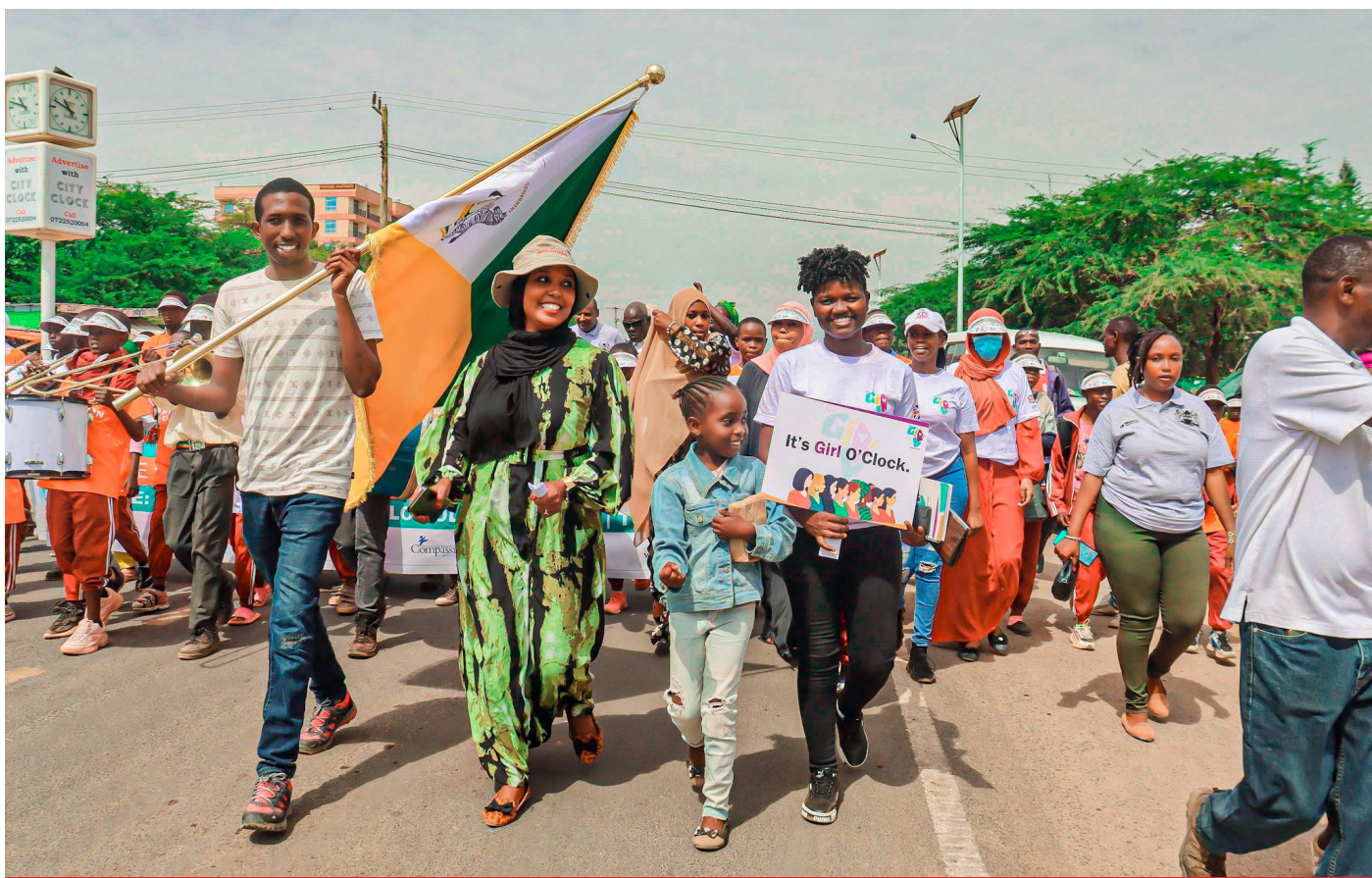
Day of the African Child event in Isiolo County