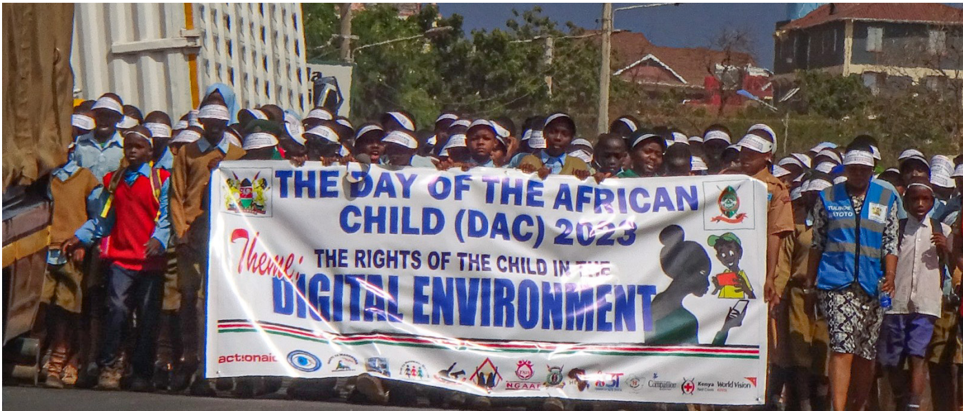
Day of the African Child event in Taita Taveta County