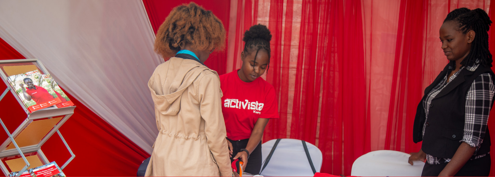
AAIK stand at the AACOSE Conference that was held at the Tangaza University College