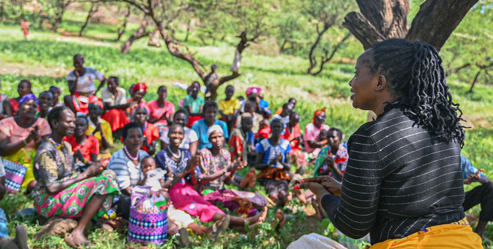
Community engagement in Komolion, Tangulbei Baringo County.