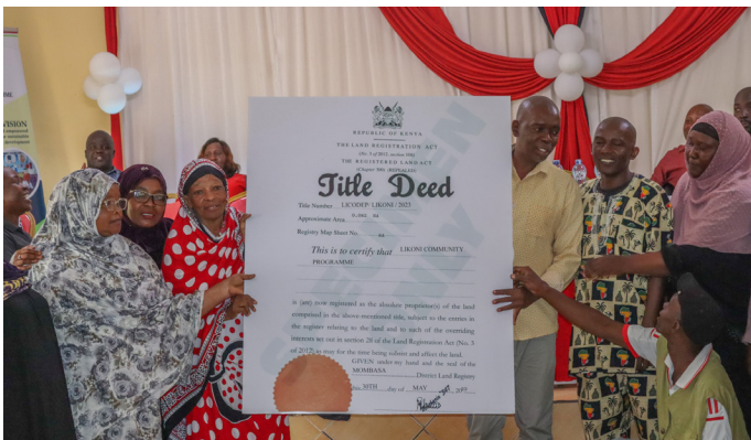
Members of LICODEP hold a dummy of the title deed during the event.

ActionAid International Kenya and Likoni Community Development Programme (LICODEP) have been partners for nearly 20 years. The two organizations began working together around 1998 and managed to mobilize and organize the community of Likoni into various facets in transforming the Likoni community and peaceful coexistence.