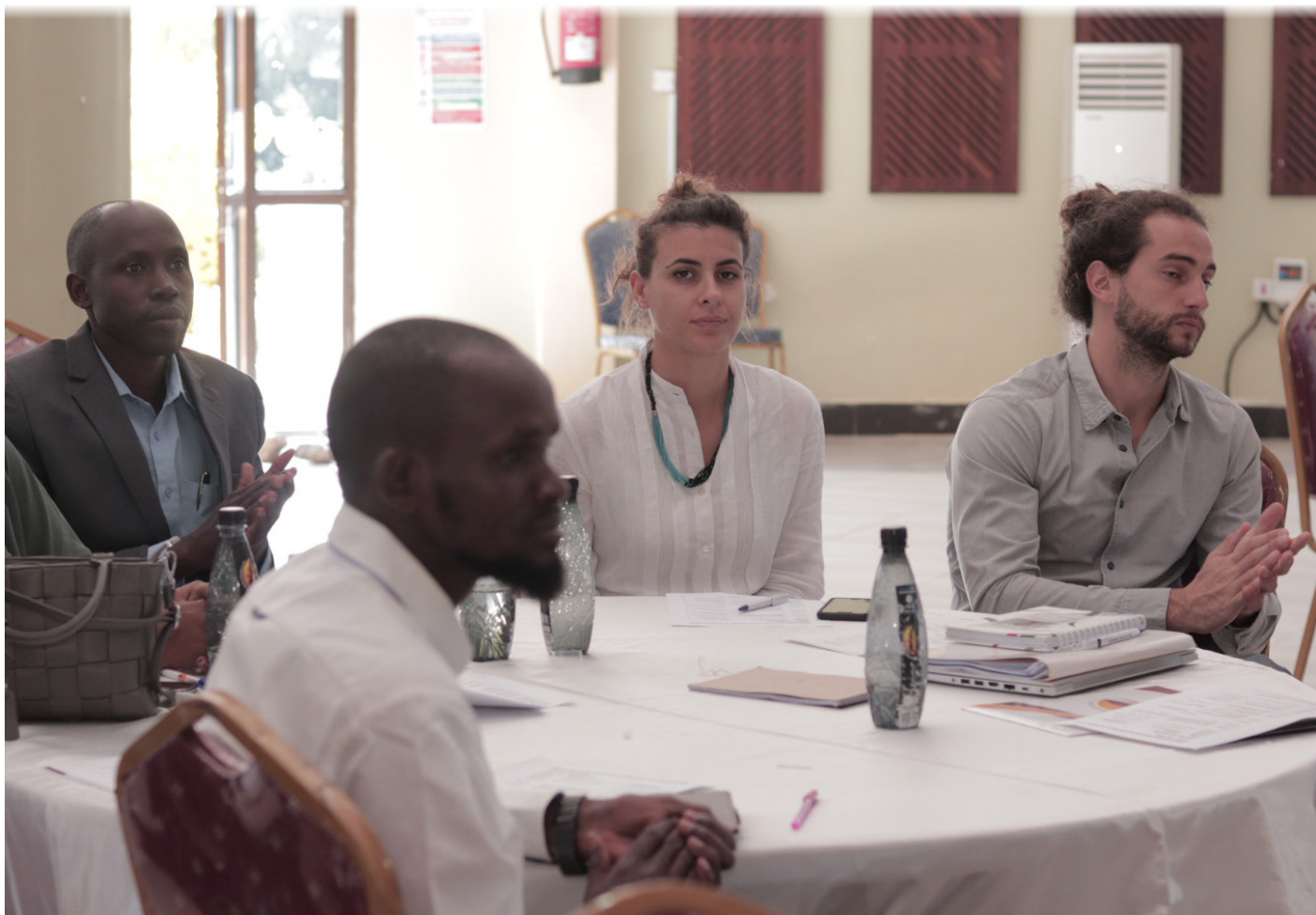
AICS Nairobi team and SAMPAC project partners follow the discussion during the SAMPAC project during their visit.

modern and more sustainable agroecology. Women and other vulnerable groups living in the target communities are improving their nutritional status with the adoption of good nutritional practices and a higher consideration of the women's role in the communities. Community institutions, including associations of producers, are improving their capacity to interact with the local authorities and the private sector, to ensure them better services and better prices for their products.