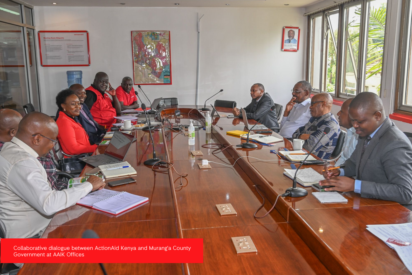
Collaborative dialogue between ActionAid Kenya and Murang'a County Government at AAIK Offices