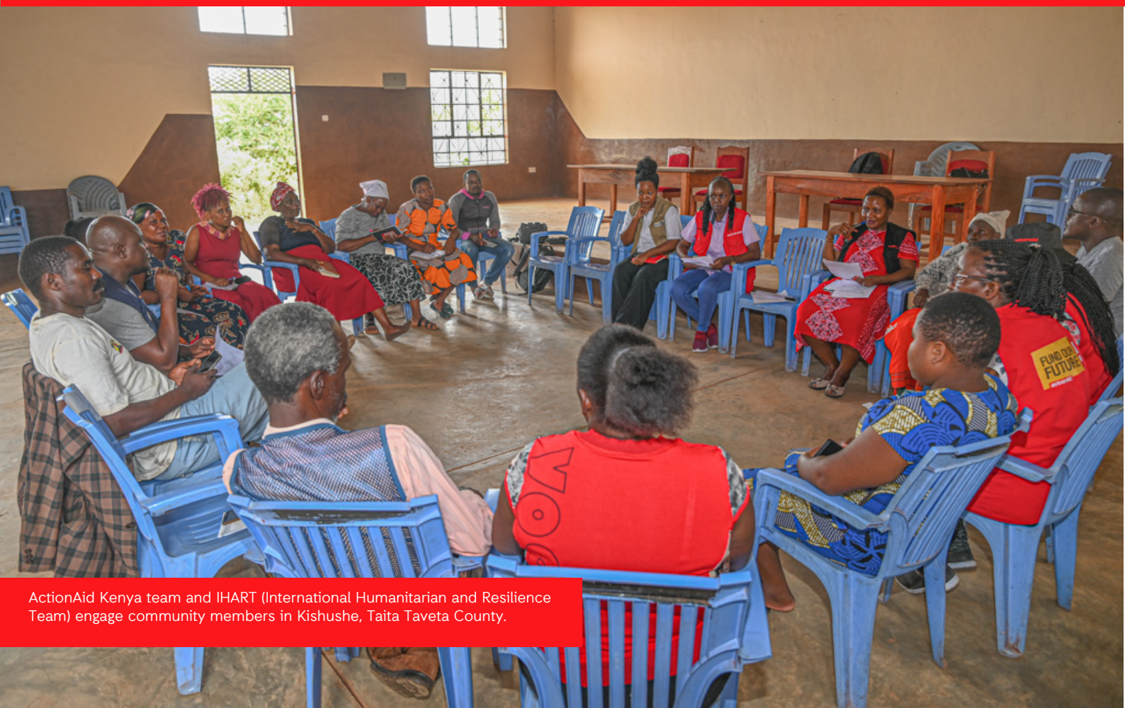
ActionAid Kenya team and IHART (International Humanitarian and Resilience Team) engage community members in Kishushe, Taita Taveta County.

On the 26th to 28th of February 2024, ActionAid Kenya and its partners in Taita Taveta County embarked on a pivotal journey, delving deep into the latest trends in humanitarian response. In a collaborative effort, they scrutinized the quality of their interventions during various crises, seeking avenues for enhancement, and reaffirming their commitment to delivering timely and effective aid to those most affected.