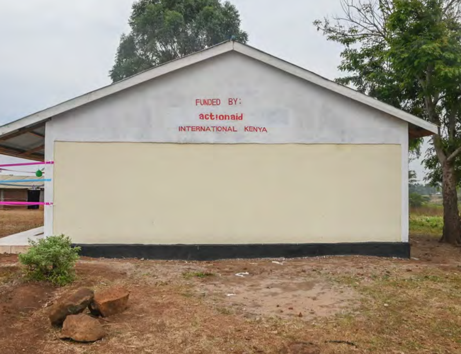
Side view: The newly constructed ECDE classroom at Kodida Primary School in Got Kojowi, Homa Bay County, set to provide young learners with a safe and conducive environment for their educational journey.