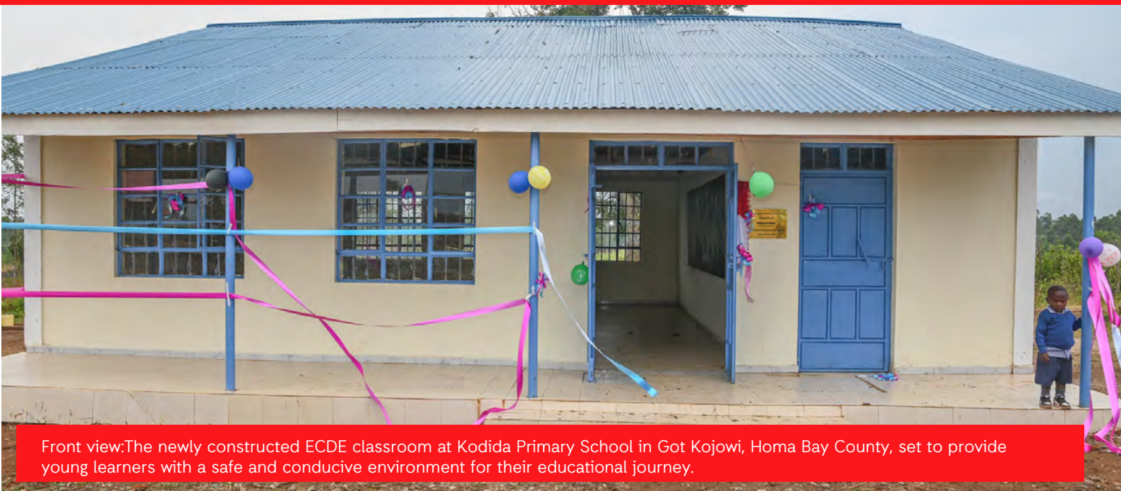
Front view: The newly constructed ECDE classroom at Kodida Primary School in Got Kojowi, Homa Bay County, set to provide young learners with a safe and conducive environment for their educational journey.

In a significant step toward improving education access in rural Kenya, ActionAid Kenya has officially handed over a newly constructed Early Childhood Development Education (ECDE) classroom at Kodida Primary School, located in Got Kojowi, Ndhiwa Sub-County, Homa Bay County. This initiative, made possible through ActionAid Kenya's Child Sponsorship Programme and the BigMe Campaign, aims to provide young learners with a safe, conducive, and welcoming environment to embark on their educational journey.