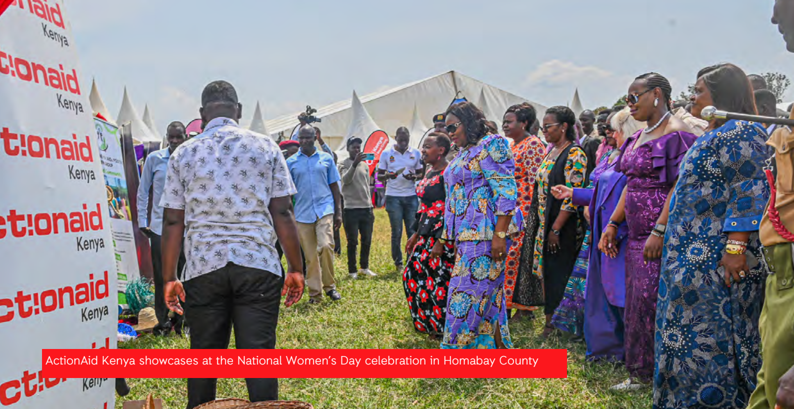
ActionAid Kenya showcases at the National Women's Day celebration in Homabay County

Through various programs, we support women in accessing leadership opportunities and advocate for their rights at the local, county, and national levels. During the national celebrations in Homa Bay, we were honored to be joined by prominent leaders, including the First Lady of Kenya, H.E. Mama Rachel Ruto, H.E. Ida Odinga, and H.E. Gladys Wanga, Governor of Homa Bay. Their presence underscored the critical importance of women in leadership and their invaluable contributions to society.