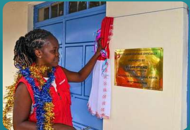
Kodida Primary's New Classroom

The once open-air classroom under a tree is now a fully finished facility featuring spacious interiors, tiled floors, large windows, and a veranda , offering young learners the comfort and dignity they deserve.