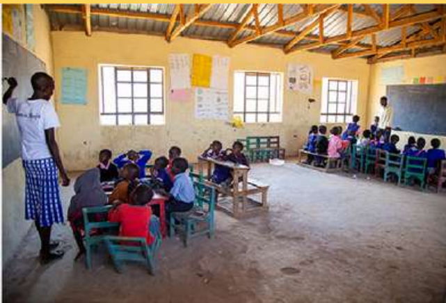
A school of 103 learners sharing just two classrooms , with five classes running in shifts