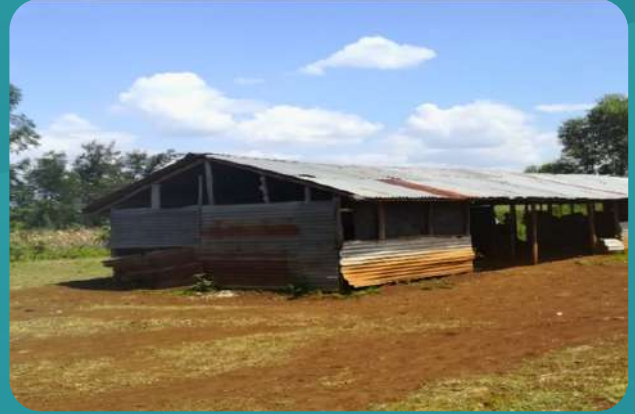
The staffroom and classes at Kodida Primary before rehabilitation

What started as a vision to provide a safe ECDE learning environment has since become a reality: the modern classroom facility has been successfully completed and launched .