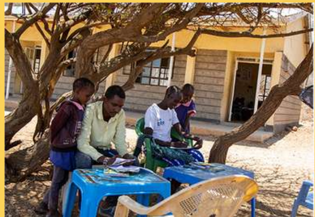
No staffroom , and only three teachers for five classes.