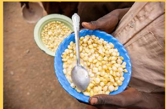
No clean water and no feeding programme in the drought stricken area

Rather than a one-off donation, what followed was a structured, two-year commitment . Immediate interventions were rolled out the following term, while longer-term fundraising continued. Over two years, Makini School Runda mobilised their parents, families, and networks, raising a total of KES 2,469,698 .