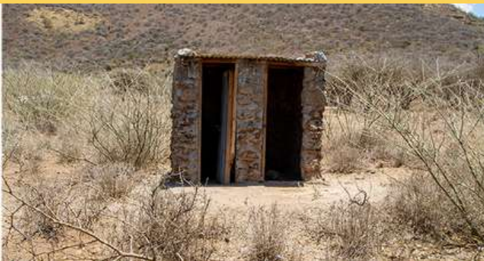
Two dilapidated toilets shared by all pupils and staff